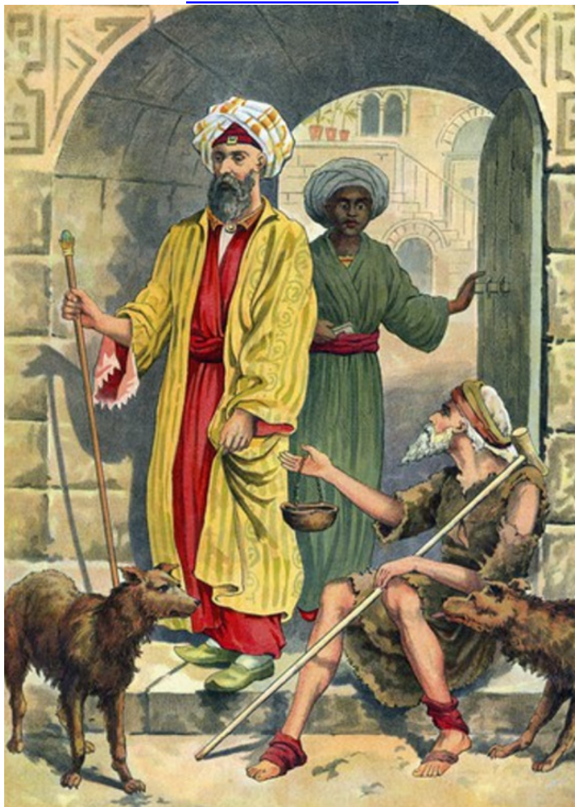
Parable of the Rich Man and Lazarus

Our Lady of Sorrows Church 217 Prospect Street, South Orange, NJ 07079 973-763-5454 www.olschurch.com