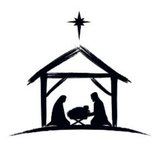
Christmas Pageant Participants Needed

This Advent, the children of Our Lady of Sorrows can help prepare the hearts of everyone in the parish for the coming of Jesus Christ in a very special way: by participating in the OLS Christmas pageant. The birth of our Savior is VERY BIG news worth sharing with everyone! Please help us deliver this exciting message to the people of the parish by having your child participate in our upcoming pageant. It's a fun way for kids to learn about their faith and a great opportunity for them to share their many talents - acting, singing and storytelling - with others. The commitment is minimal, costumes are provided and the photos are always PRICELESS!