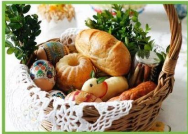
EASTER BASKETS BLESSING